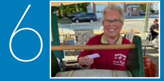
6 Step Out for Hospice