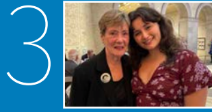
3 Celebration of Caring