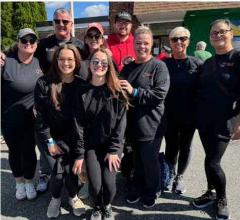
Team members from Mooney Dental, a Gold Sponsor, took part in the 3-mile walk.