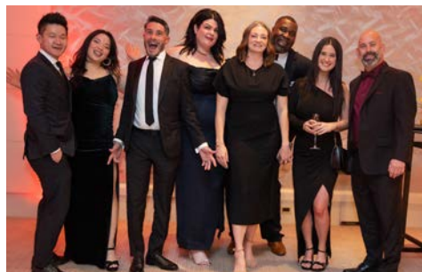
Mutual of America, Presenting Sponsor