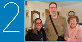
2 Supporting couple after LVAD surgery