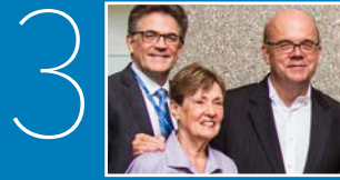
3 Congressman meets with VNA Care leaders