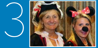
3 Make a difference at a fall fundraiser