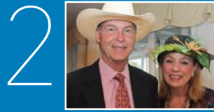
2 North Shore Cabinet raises vital funds